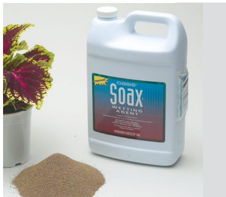
Soax ® container and granules