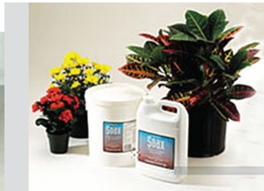
Soax ® dry and wet product containers

Soax ® wetting agent helps to achieve consistency in growing media by aiding in the even dispersing of water and nutrients throughout the entire root zone. As a result, it helps prevent water masses from forming and helps to reduce the occurrence of spot drying. Soax ® wetting agent helps to ensure air-to-water ratios are uniform throughout the entire root zone and helps increase the available feeding sites for plant roots. Soax ® helps to improve consistency, quality and efficiency of commercial growing media during crop production and beyond. In addition, Soax ® helps the growing materials, such as peat moss, to overcome the resistance to the initial wetting. To create the best possible environment for all plant roots, growers can choose from liquid and/or granular options of the Soax ® wetting agent.