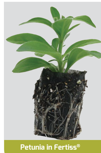
Petunia in Fertiss ®

Best for (crops): vegetative annuals and perennials, woody ornamentals, silviculture, tissue culture, and germination of seeds