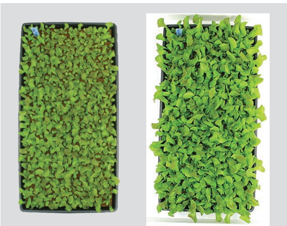
OASIS ® HORTICUBES ® XL: no fertilizer (on the left) and Hydroponic Fertilizer (on the right) with initial watering. However, both trays were watered with Hydroponic Fertilizer similarly from day 3 onwards.

Contact your OASIS ® Grower Solutions Sales Representative for more information.